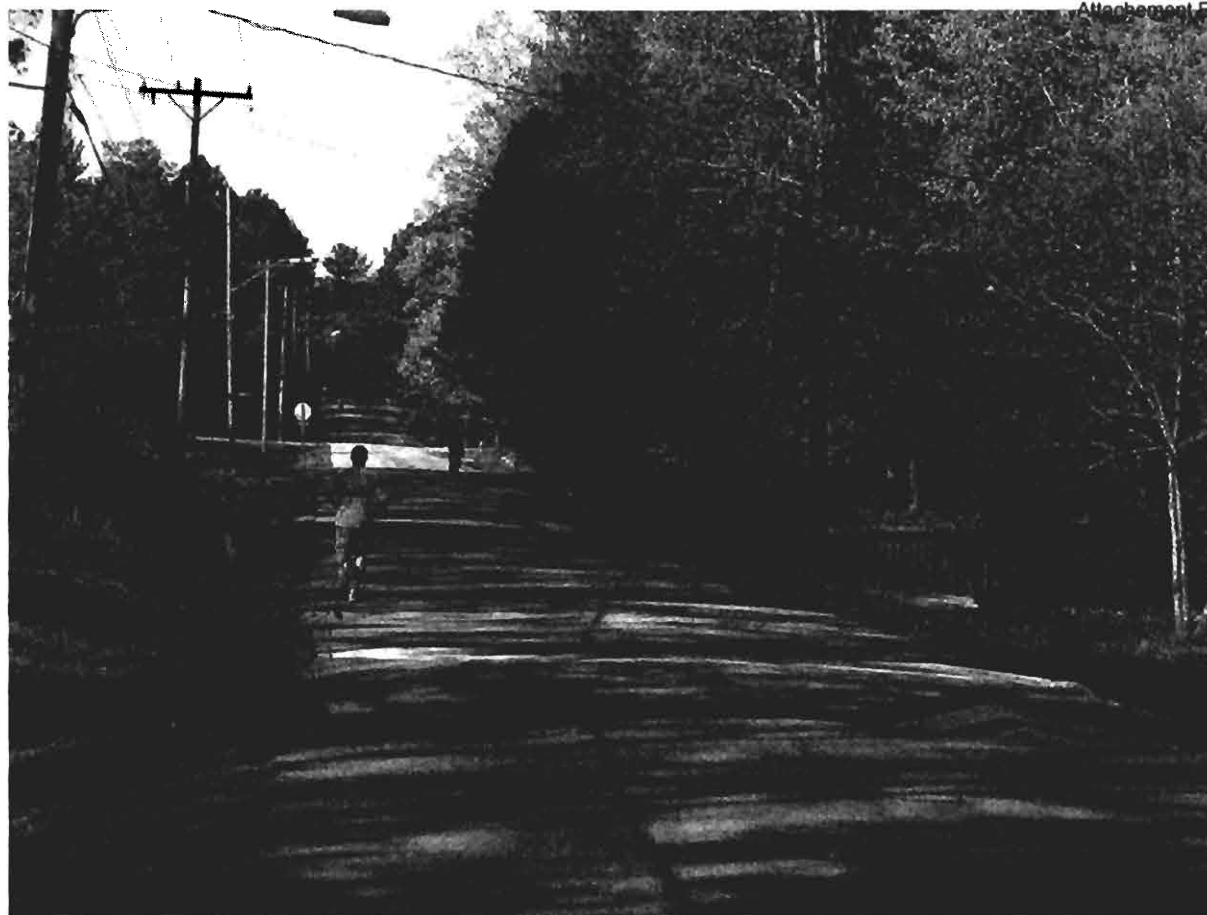
Speed Table 2 between Hillsborough Rd. and Phipps St.