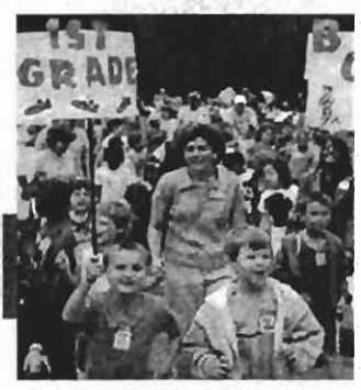
WHERE: Carrboro Elementary